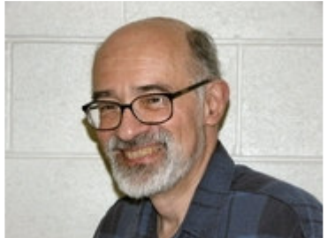
3rd Place Tie 3.0 / 4 points