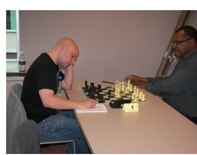
109th Pawn-Eater Sept 18, 2010