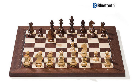
DGT Board from DGT website

http://digitalgametechnology.com/site/index.php/Electronic-Boards/dgt-bluetooth-wireless-e-board.html