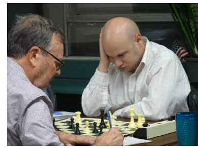
MetroWest Chess Club Nov 9, 2010