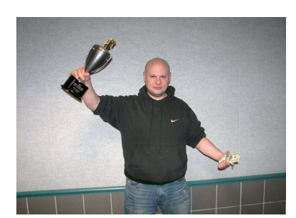
119th RI Open Chess Nov 12, 2010