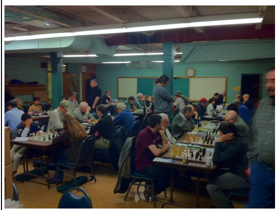
Last night at the old Natick Senior Center before the move to the temporary Natick Senior Center at 80 Oak St – see inside for map and directions.