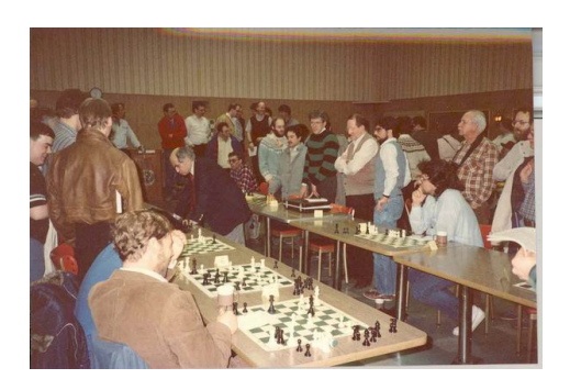
Mikhail Tal simul at Framingham CC March 8, 1988 (later became MetroWest CC)