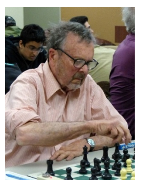
Eldridge, also in May 3 1983 Curdo simul