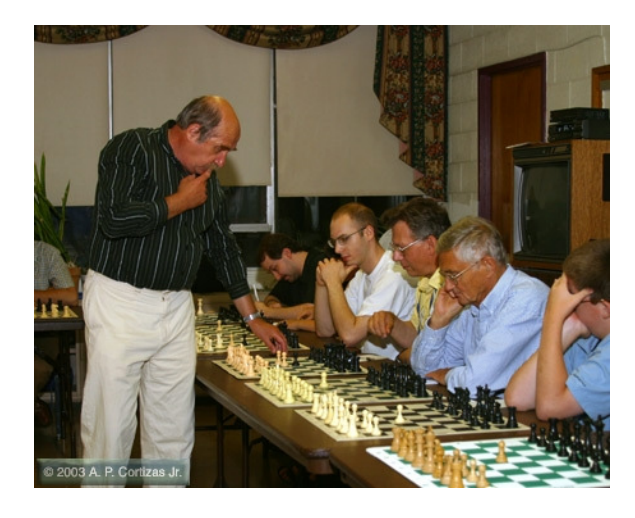
MetroWest CC hosts IM Foygel for a simul in 2003 (20<sup>th</sup> Anniversary).